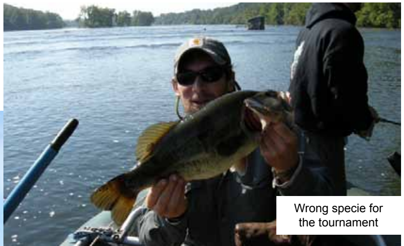
Wrong specie for the tournament