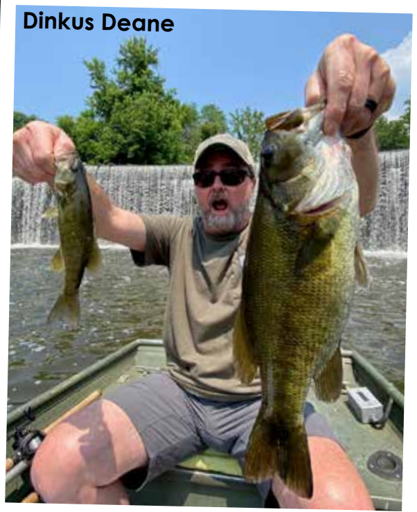
Big Bass, Little Bass at Bosher's Dam.