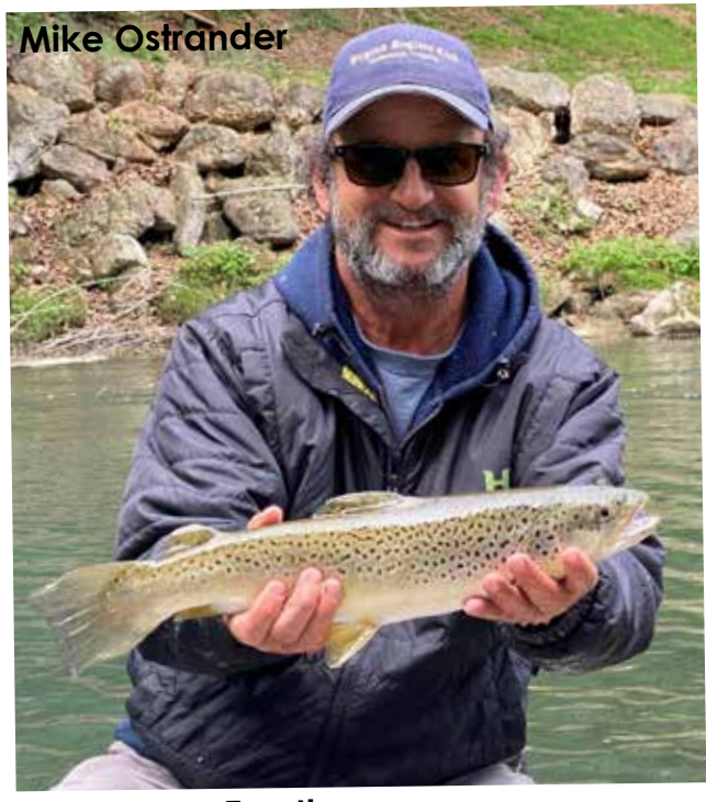
Nice Brown Trout!