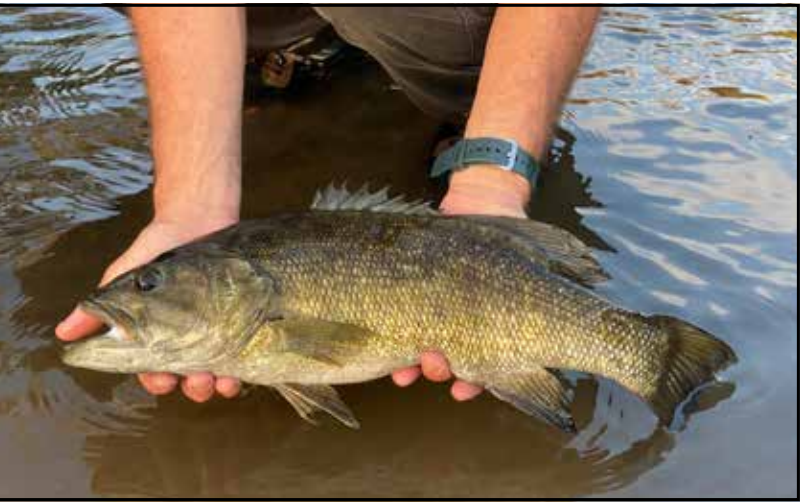
It appears to be BIG smallmouth bass catching season! WOW!!!

President's Message page 2 VAC Leadership Team, page 3 QR Code for Texting Messaging, page 4 Angling Rule Changes, page 5 Conservation Legislation, Pages 6-7 Tournaments & Expeditions, page 8 Past Program Highlights, page 9 For Your Information, page 10 Species Leader Board, pages 11-17 Fishing Memories, pages 18-19