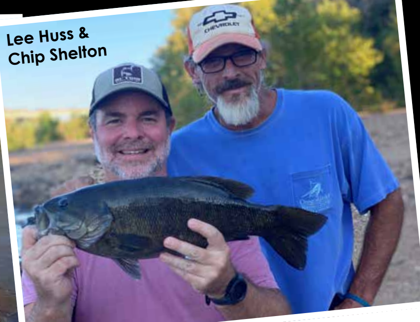
Smallmouth Bass, 4lb 9oz