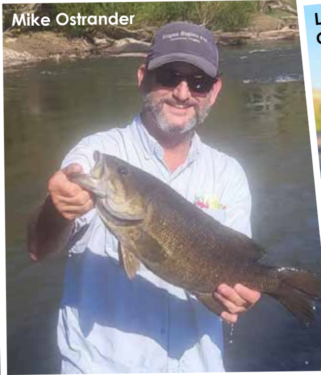
Smallmouth Bass, 4lb 14oz on 6lb line