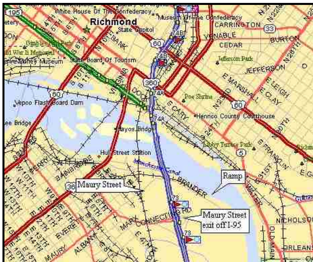
Map to shad fishing on the James

Boat Ramp: Since 9/11 the City Sheriff's Office has placed a guard at the entrance gate to the Ancarrow's boat ramp. Be prepared to stop and show identification and fishing license.